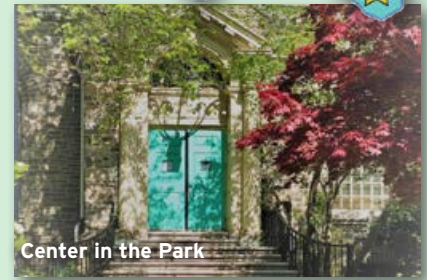
Center in the Park

Center in the Park easily accessed in Germantown, offers fun classes, support with utilities, as well as in-home care for seniors. CIP relies on participant input not only to determine programming, but they have played a significant role in research on aging and senior health. CIP provides testimony at county and state levels to inform the PA Department of Aging's State Plan and the Philadelphia Corporation for Aging's (PCA) Area Plan on Aging.