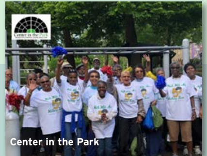
Center in the Park